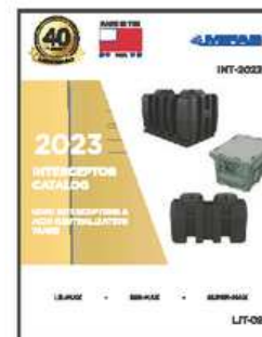
INT-2023 INTERCEPTORS & ACID NEUTRALIZATION TANKS (LIT-093)