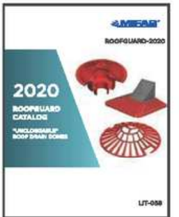
ROOFGUARD-2020 ROOFGUARD ROOF DOMES (LIT-058)