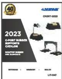
C-PORT-2023 ROOFTOP RUBBER PIPE SUPPORTS (LIT-047)