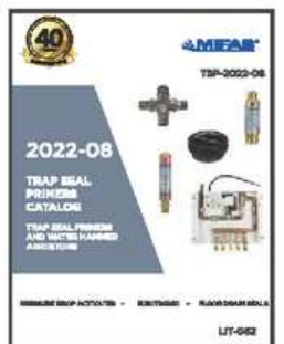
TSP-2022-08 TRAP SEAL PRIMERS (LIT-062)