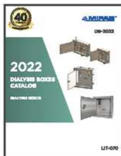
DB-2022 DIALYSIS BOXES (LIT-070)