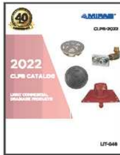
CLPB-2022 LIGHT COMMERCIAL PRODUCTS (LIT-048)