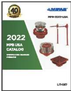
MPB-2022-USA SPECIFICATION DRAINAGE (LIT-067)

P.O. Box 6005 Ashland, VA 23005 (804) 798-2600