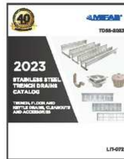
TDSS-2023 STAINLESS STEEL TRENCH DRAINS (LIT-072)