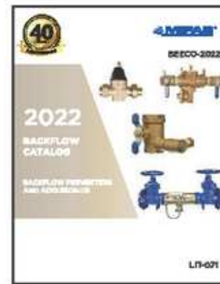
BEECO-2022 BACKFLOW PREVENTERS AND ACCESSORIES (LIT-071)