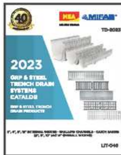
TD-2023 GRP & STEEL TRENCH DRAINS (LIT-046)