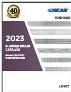
TDSD-2023 SHOWER DRAINS (LIT-077)