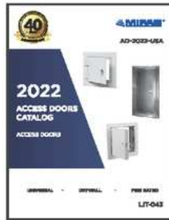
AD-2022-USA ACCESS DOORS (LIT-043)