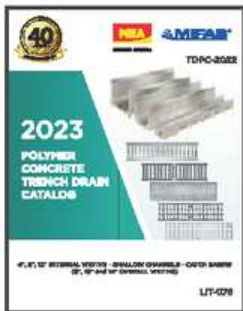
TDPC-2023 POLYMER CONCRETE TRENCH DRAINS (LIT-076)