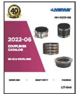
NH-2022-06 NO HUB COUPLINGS (LIT-044)