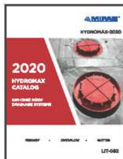
HYDROMAX-2020 SIPHONIC DRAINAGE (LIT-062)